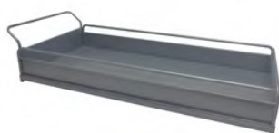
PLATFORM 885X1850XH230 MM