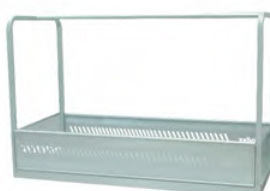
PLATFORM 1800X800 MM