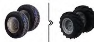
TRACTOR WHEELS (2 WHEELS)