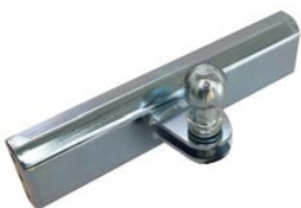
TOWBALL TRAILER HITCH