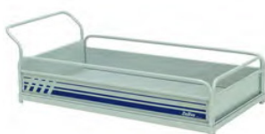
PLATFORM 885X1250XH230 MM