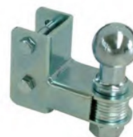
TOW BALL PIN COUPLING