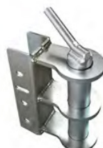
DROP PIN Ø38 MM